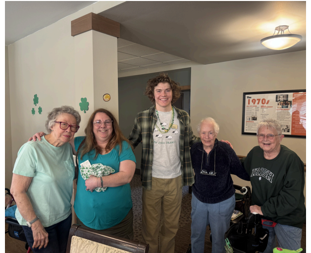
Winners of Trivia!